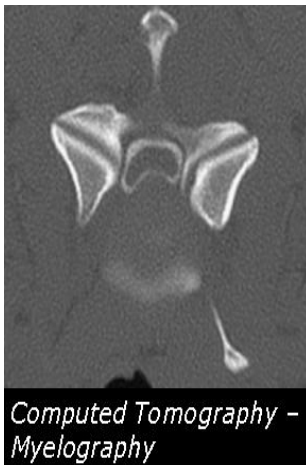
Transverse plane of CT-myelography of a 6-year old mix-breed dog at the level of C5-C6. The subarachnoid space is filled with a radiolucent contrast material (white). The spinal cord (dark) is delineated by the surrounding subarachnoid space. A ventral spinal cord compression secondary to the protrusion of the intervertebral disc with the associated dorsal ligamentous structures are evident. The spinal cord lost its normal rounded appearance and is markedly distorted.

Owing to the risk of neurologic deterioration after these cervical manipulations during general anesthesia, only linear traction myelography or linear traction MRI views continue to be routinely used. Cross sectional computed tomography (CT) combined with myelography may also help to better visualize spinal cord compression and spinal cord atrophy.